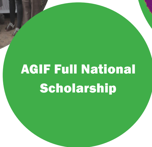
AGIF Full National Scholarship