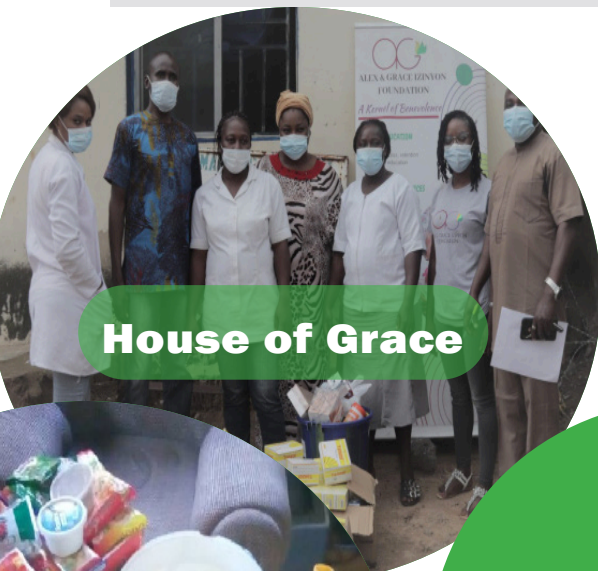
House of Grace

However, thanks to the amazing team of AGIF, we were able to come up with strategies to combat the impact of the lockdown on some projects enabling us reach and promote the lives of the disadvantaged in our society, as is our mission.