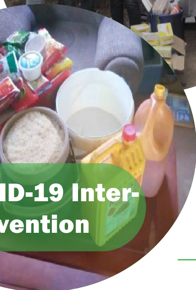
COVID-19 Inter- vention